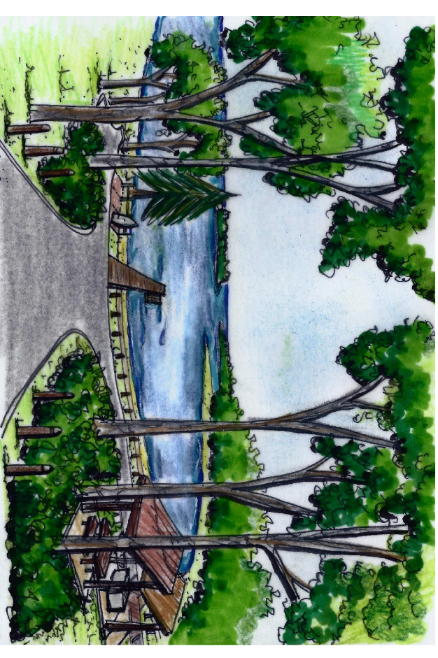
ARTISTIC IMPRESSIONS SHOW VIEW OF THE BOARDWALK, PICNIC AREAS AND PLAY SPACE.