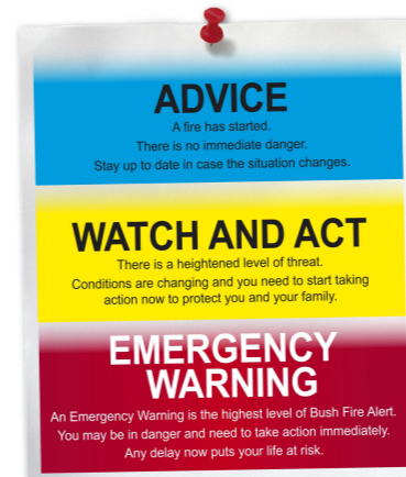
The Three Bush Fire Alert Levels.

NOTE: Impact areas have been prepared at a community level and are based on an Extreme Fire Danger Rating. Information provided on this map is not to be used for building / planning purposes.